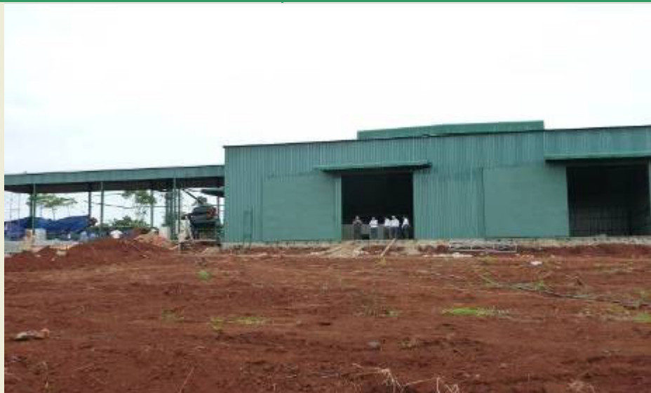
Looking out from the warehouse!