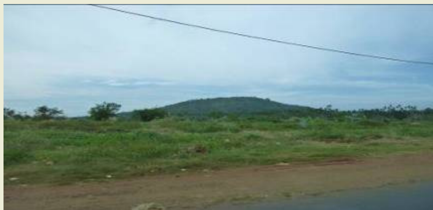
The 'Flower mountain' in CuM'gar

The group of farmers from Ea-Kiet initially formed to make a coop for Fairtrade Certification. They are now set to be the proud shareholders of the CuM'gar – Ea-Kiet Wet Mill.