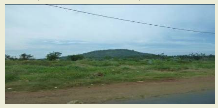
The 'Flower mountain' in CuM'gar

The group of farmers from Ea-Kiet initially formed to make a coop for Fairtrade Certification. They are now set to be the proud shareholders of the CuM'gar – Ea-Kiet Wet Mill.