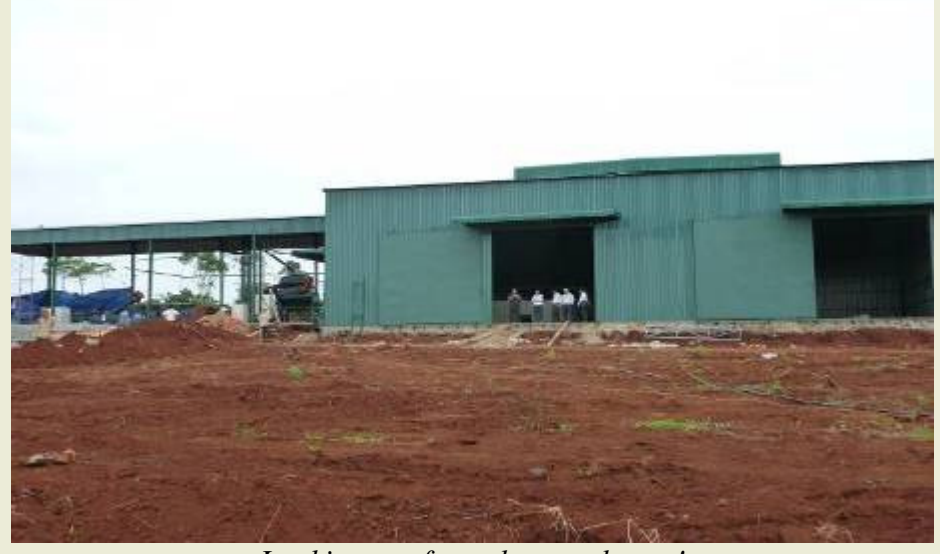
Looking out from the warehouse!